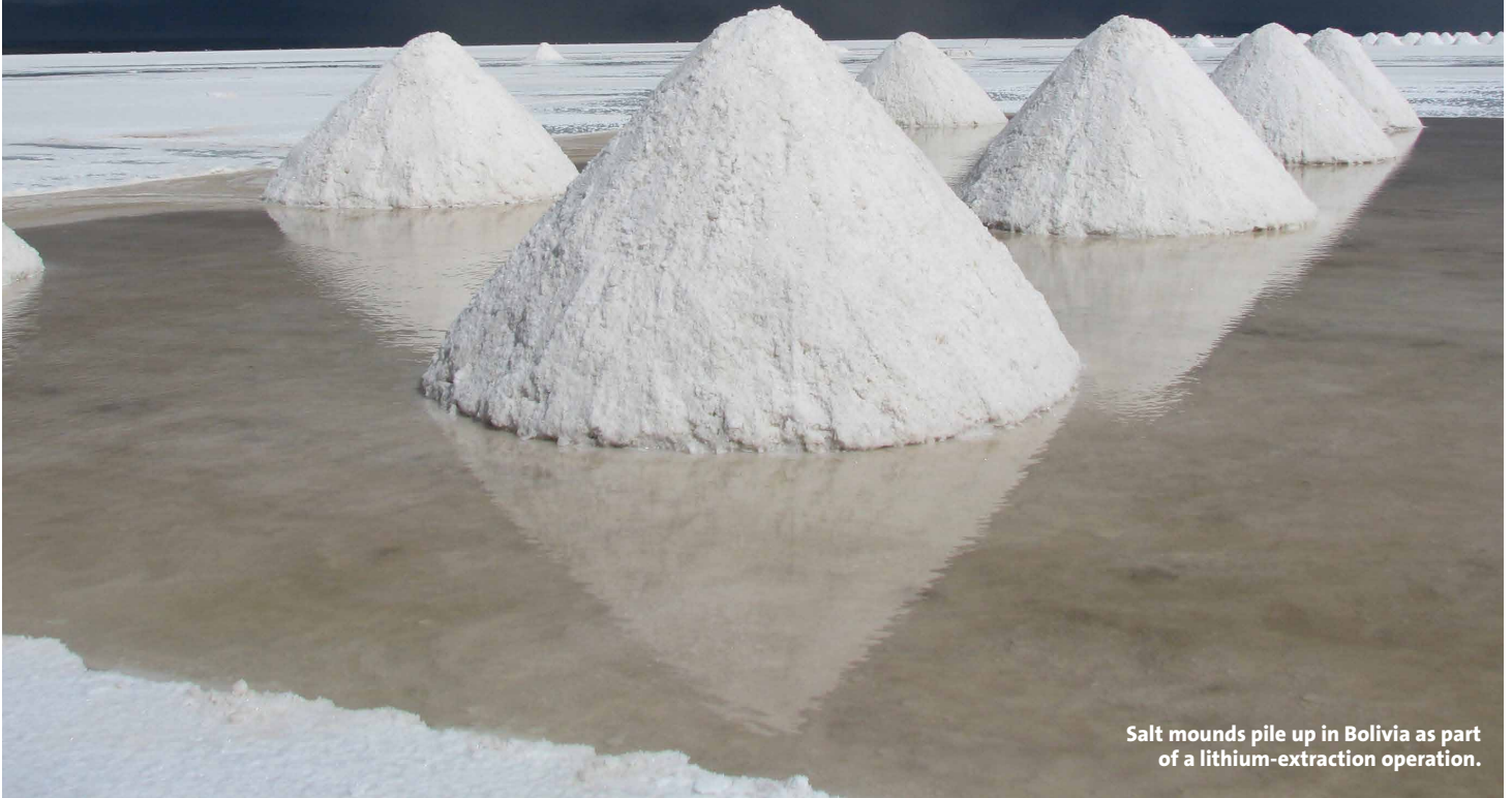
Salt mounds pile up in Bolivia as part of a lithium-extraction operation.