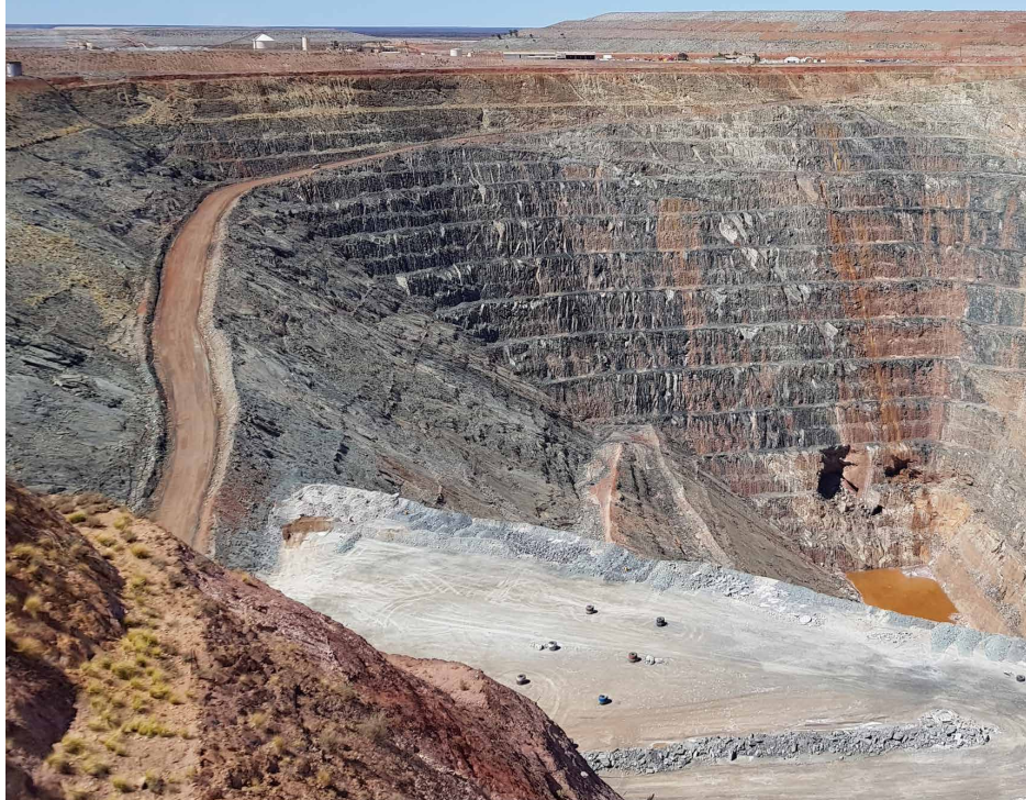
An open-cut gold, lithium and iron ore mine in Leonora, in Western Australia.