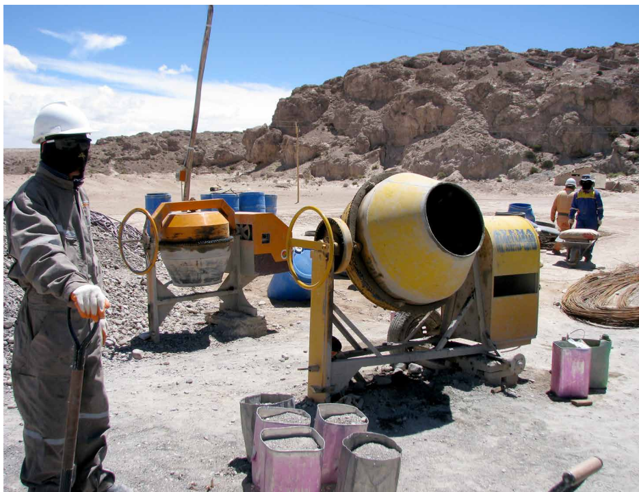
Workers mix cement in Rio Grande, Bolivia, as they work to extract salt brine to collect lithium. Brines in South America supply a good chunk of the world’s lithium, and harvesting it in evaporation ponds leaves behind salt waste.